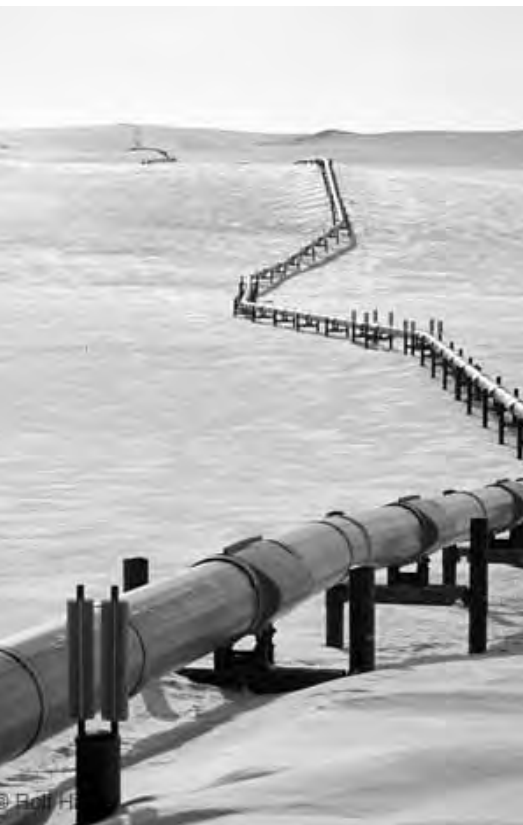
Residents of the state of Alaska in the United States receive dividends from oil revenues