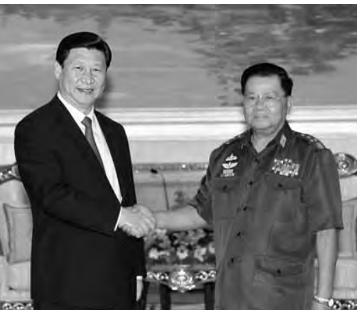
Visiting Chinese Vice President Xi Jinping (L) meets with Than Shwe, chairman of Myanmar’s State Peace and Development Council, in Nay Pyi Taw, Myanmar, Dec. 20, 2009.

Based on this exchange rate system, the military regime has hidden 99% of the Yadana gas exports from 2000 to 2008 (an estimated US$4.80 of US$ 4.83 billion). The unrecorded gas export revenue in the national budget from the Yadana project alone could build more than 200,000 schools for 30 million children. 23