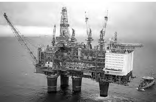
Today there are 48 fields in production on the Norwegian Continental Shelf

A developed country with health, education, and welfare indicators consistently among the world's best, Norway depends largely on subsea oil and natural gas reserves. It is the world's third-largest exporter of oil, with estimated reserves of nearly 7 billion barrels as of 2008. Similarly, Norway is among the world's top ten natural gas producers, with estimated 2008 reserves of 82 tcf. 75