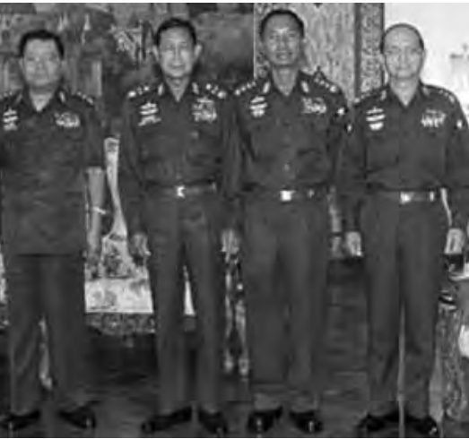
Leading members of Burma's previous junta are in leading positions in the new government (left to right: Senior General Than Shwe, Vice Senior General Maung Aye, General Thura Shwe Mann (now speaker of the House) and General Thein Sein (now Prime Minister) in October 2007.