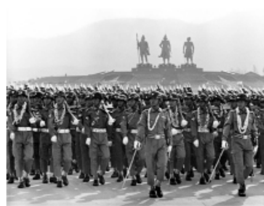
Military parade in the new capital which cost over US$200 million to build

In 2009, while the Tripartite Core Group (UN, ASEAN, and Burma's Junta) was seeking emergency funds of US$ 693 million for urgent humanitarian assistance for the more than 100,000 people affected by Cyclone Nargis, the military regime made a US$630 million purchase of twenty MiG-29 fighter jets and Mi-35 attack helicopters from Russia. 29