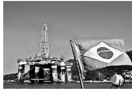
Brazil shares oil and gas revenues with states and municipalities

The Brazilian example of sharing/distributing oil and gas revenues among national, state and municipal entities as well as between producing and non-producing regions could be applied to Burma. One main difference is in amount of government revenues derived from oil and gas. In Brazil, oil and gas revenues account for less than four percent of the country's GDP, whereas in Burma oil and gas accounts for most of the government's revenue. The distribution of revenue in Brazil does not generate the sort of controversy it would do in Burma. 87