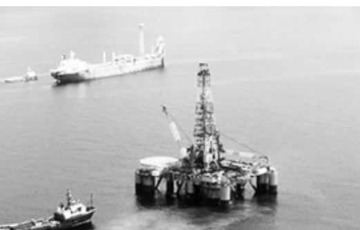
oil and gas drilling in Timor's sea

Three main legislative devices have been instituted to ensure the management of resource revenues in Timor Leste: the Petroleum Mining Code, the Petroleum Tax Law and the Petroleum Fund Law. The Petroleum Mining Code for the Joint Petroleum Development Area grants ownership of natural resources to the state, while declaring that they should be "used in a fair and equitable manner in accordance with national interests." This includes creating "mandatory financial reserves" as well as environmental preservation. 90