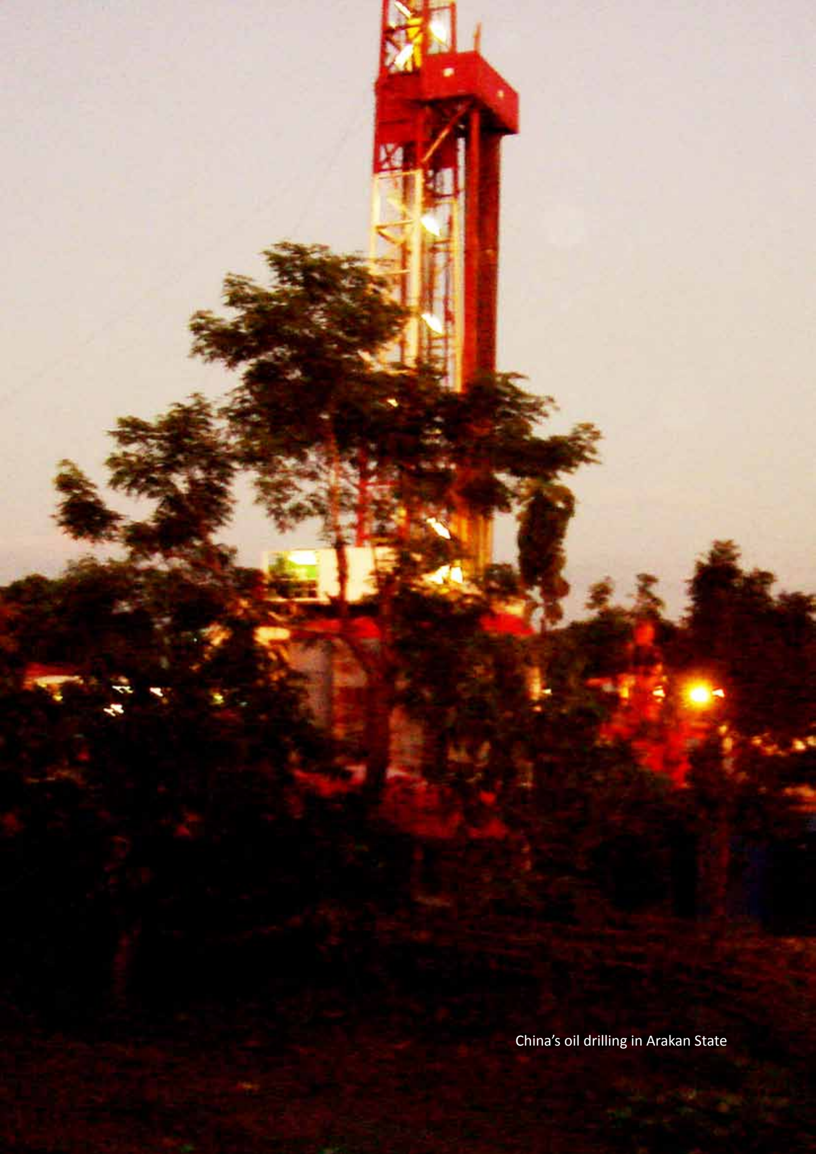
China's oil drilling in Arakan State