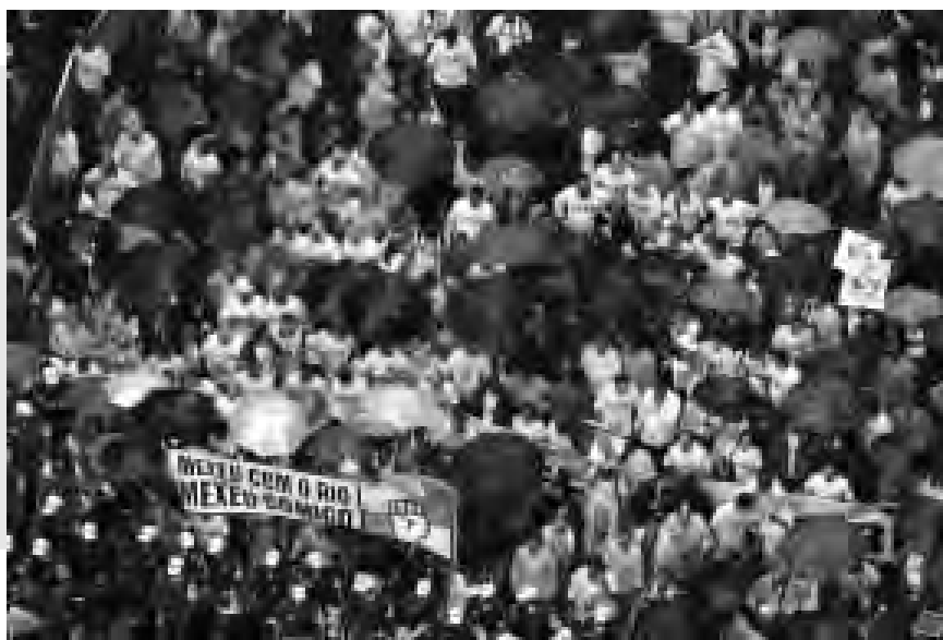
People of Rio in Brazil protest to keep gas revenues for the benefit of their state