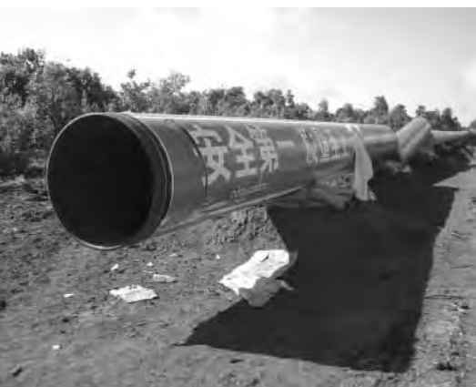
Pipeline to take Shwe gas to China Photo tab

years. The Zawtika block has proven gas reserves of 1.4 tcf. Under the gas sales agreement, PTT will produce 300 mcf a day, of which 240 mcf will be sent to Thailand. The remaining 60 mcf will remain in Burma. 10