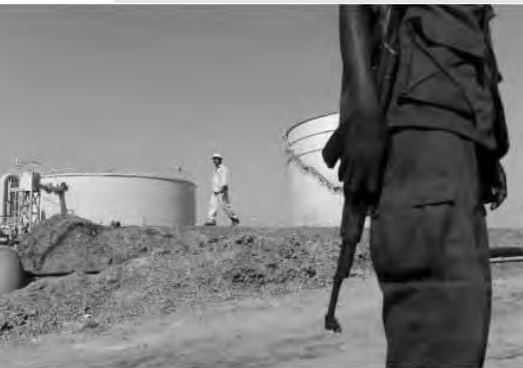
Sudan ended civil war with an agreement to share oil revenues equitably