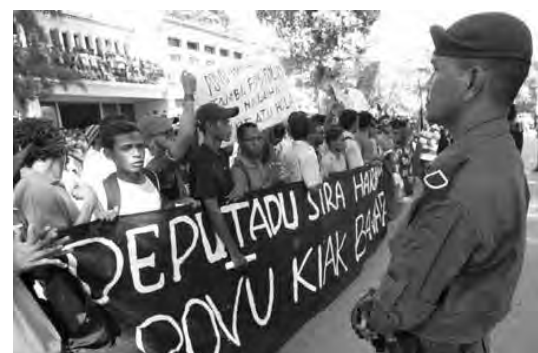
Students at the East Timor National University protest against the purchase of luxury cars for each National Parliament member

Timor Leste became an EITI Candidate Country in 2007 and was accepted as an EITI compliant country on 1 July 2010. 105 However, the Petroleum Fund Law does not provide any legal requirement for companies to publish their payments, despite suggestions of civil society groups. 106 In addition to the EITI workplan, several documents regarding oil revenues and contracts are provided on the websites of government ministries in multiple languages. 107 The previous government also gave information sessions to local communities through road shows, where they provide explanations about oil revenues and questions are answered. 108