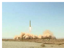
Iran successfully test-fires multiple-range missiles