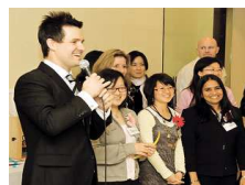
New expat community center opens