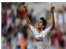
Real Madrid routs Tenerife 3-0