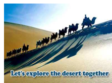
Trekking in China's desert

SiteMap | About Us | Contact Us | Advertise with Us (广告及商业业务) | RSS | Newsletter | Feedback