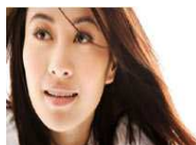
Michelle Ye's close-up photoshoots