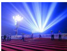
Tiananmen rostrum ready for celebrations