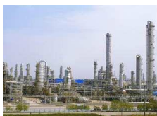
Chemical factory causes citizen reaction