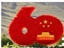
Lhasa dressed up for National Day