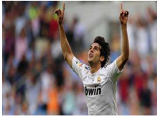
Real Madrid routs Tenerife 3-0