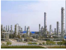
Chemical factory causes citizen reaction