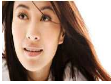
Michelle Ye's close-up photoshoots