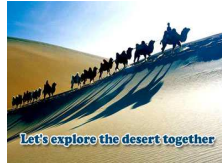
Trekking in China's desert

SiteMap | About Us | Contact Us | Advertise with Us (广告及商业业务) | RSS | Newsletter | Feedback