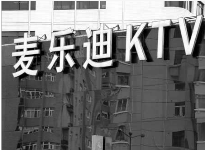
A KTV bar in Shanghai. China's first ever regulation on karaoke programming, which set technical standards for all songs used in the karaoke industry, has come into effect.

China's first ever regulation on karaoke programming, which set technical standards for all songs used in the karaoke industry, has come into effect.